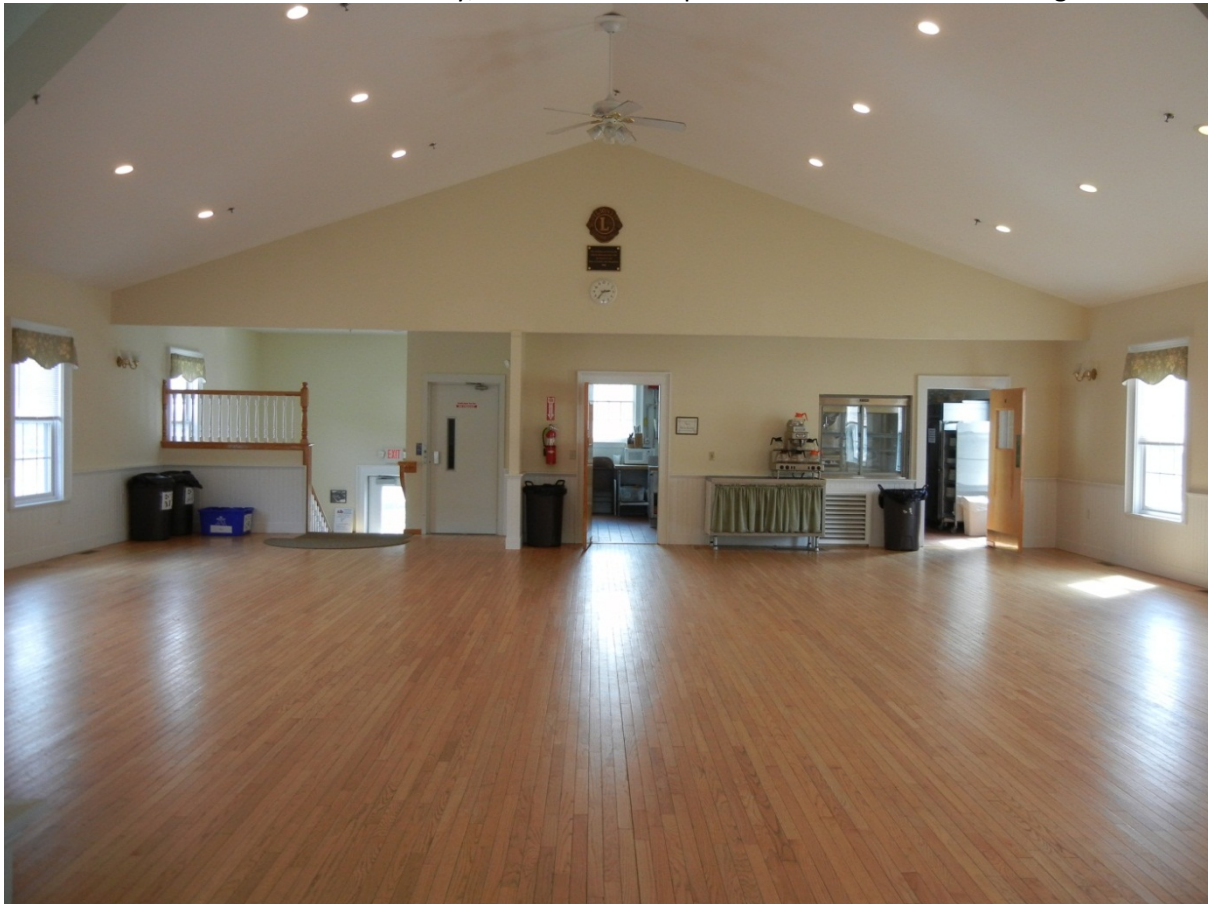
Photos taken from front entry, then around the perimeter of the room to the right.