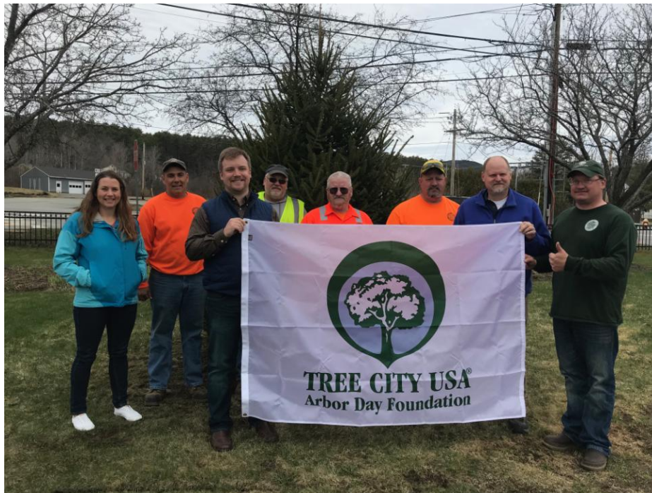
Photo: Town Manager, DPW Personnel, and Recreation Director commemorate the planting of a new "Town Tree" at Huse Park on Arbor Day 2018

Arbor Day was this past Friday, April 27, 2018. The Town held a brief tree planting ceremony at Huse Park and read the 2018 Arbor Day Proclamation. A spruce tree was planted to be the "Town tree" that is used for future holiday lighting displays. We hope everyone enjoys the tree and that it adds to Enfield's sense of community spirit while provide a whole host of environmental benefits.