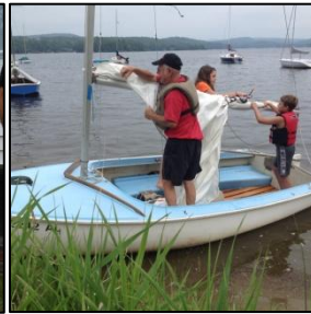
Youth Summer Sailing Program