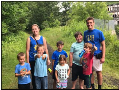
ERC goes for a hike!