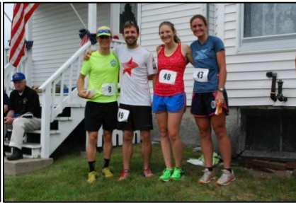
“4 for the 4 th ”