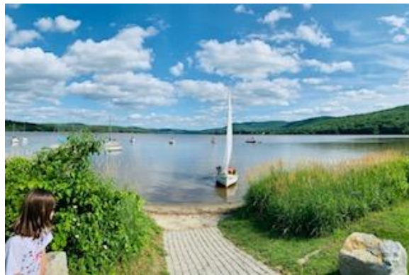
Youth Sailing Program 2019 – Mascoma Lake