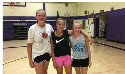
These girls putting in the work to get better – and smiling about it!

Theater Camp was an amazing success and all the participants did an incredible job in their two performances. We had 40 children ranging in age from 6-14 and in just one week of rehearsal, they performed in a musical comedy based on the Mark Twain classic, “The Prince and the Pauper”. Thank