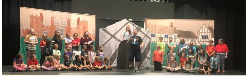
Theater Camp 2019 Rehearsal

you to everyone who came out on Friday and Saturday to support these incredible children!