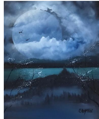
Paintings from Left to Right: Emerald Lake (9/20), Field of Poppies (9/21) and Full Moon (10/12)