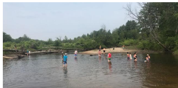
Camp X out and eXploring!

Our Basketball Skill Sessions for girls entering grades 6-8 finished up on August 14th. We had a great turn out each week of dedicated players looking to improve their skills. Thank you to all our guest coaches and to the parents/guardians for supporting this program. We look forward to offering it again next summer!