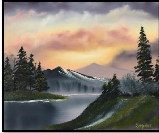
Bob Ross Painting Class on 11/16 "Sunset Aglow"