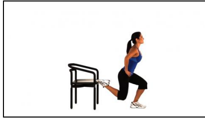
Chair Yoga & Exercise Weekly on M, W, F

The Enfield Recreation Department continues to offer the highly attended Chair Yoga/Exercise classes on Mondays 9:30 – 10:30, Wednesdays 9:00 – 10:00, and Fridays 9:30 – 10:30 at the Enfield Community Building. These classes are low impact and focus on stretching, balance, strength and meditation. The classes are only $5.00 and open to ALL levels!! No RSVP required.