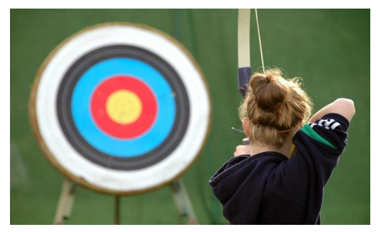
Youth Archery Lessons

General Class Information: The first four dates will be inside classroom and Saturday 5/16 will be in and out. So, dress accordingly and bring a bag lunch. The fee is $5 and all 5 date must be attended. We have limited space and will not be able to go over 20 students.