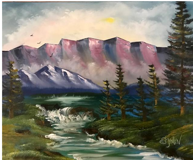
Bob Ross Painting Class on 12/6 “Bubbling Mountain Brook”

Online Registration Site: https://mvpr.recdesk.com/Community/Home