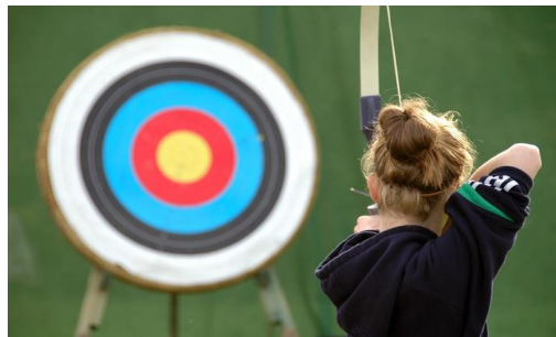
Youth Archery Lessons

The Enfield Recreation Department continues to offer the highly attended Chair Yoga/Exercise classes on Mondays 9:30 – 10:30, Wednesdays 9:00 – 10:00, and Fridays 9:30 – 10:30 at the Enfield Community Building. These classes are low impact and focus on stretching, balance, strength and meditation. The classes are only $5.00 and open to ALL levels!! No RSVP required.