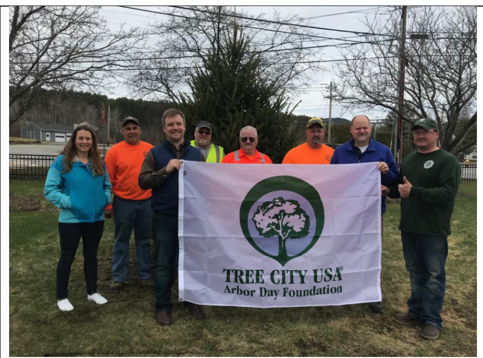
Photo: Town Manager, DPW Personnel, and Recreation Director commemorate the planting of a new "Town Tree" at Huse Park on Arbor Day 2018