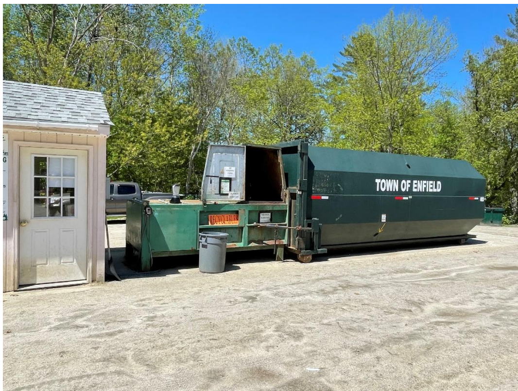
Current Compactor Setup