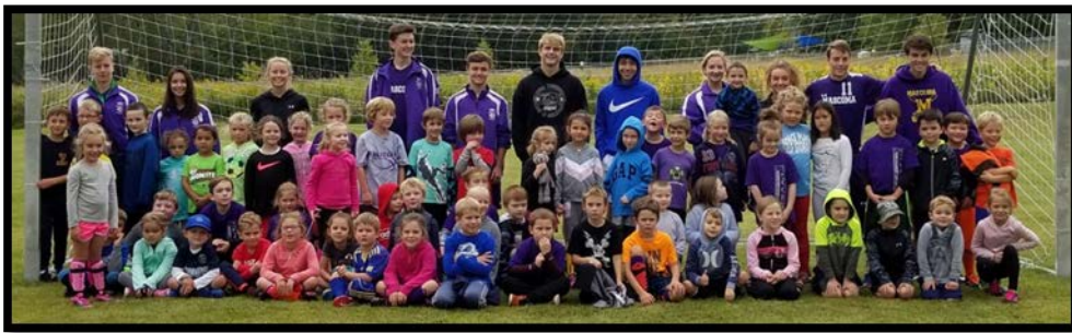
Youth Soccer Skills Clinic – Saturday, September 14, 2019

On Saturday, September 14 th , the Mascoma High School Soccer Team and Coaches came out to Shaker Recreation Field and coached a youth soccer skills clinic for Pre-K – 4 th grade students. We can't thank the players and coaches enough for giving up their time on a Saturday to work with these young soccer players. We can't wait to offer more events like this in the future. We also want to thank the Friends of Mascoma for their generous donation of healthy snacks for the kids!