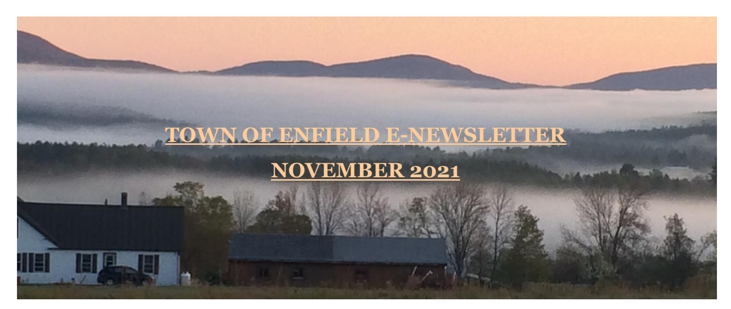
Fogged In By Sharelle Dixon