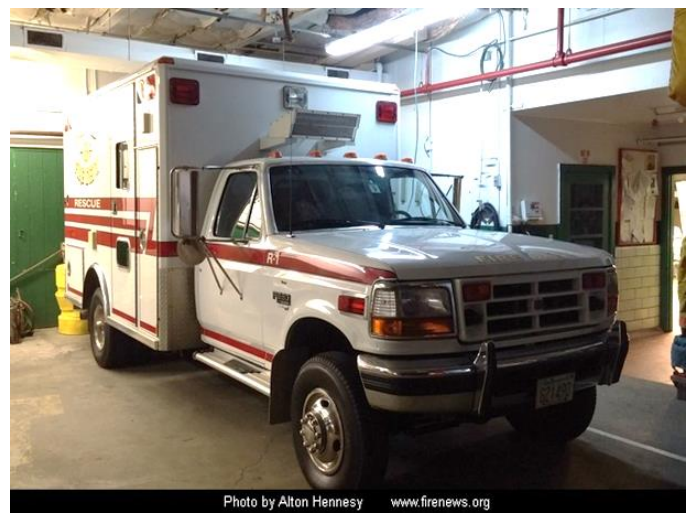
Rescue Truck before start of project.