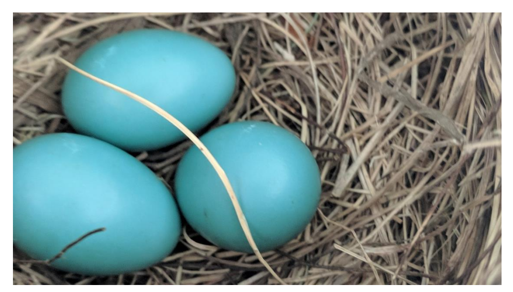
Welcome to spring!