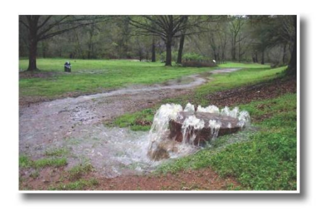
A recent survey shows that towns have spent an average of $40,500 dealing with unflushable items in sewer systems.