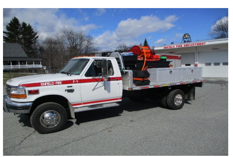
Forestry ready for service.

Please consult the <u>Fire Department's page</u> on the Town website about campfire permits and permits needed prior to burning brush.