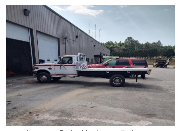
Aluminum flatbed body installed.