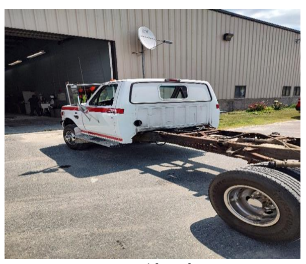
Box removed from frame.