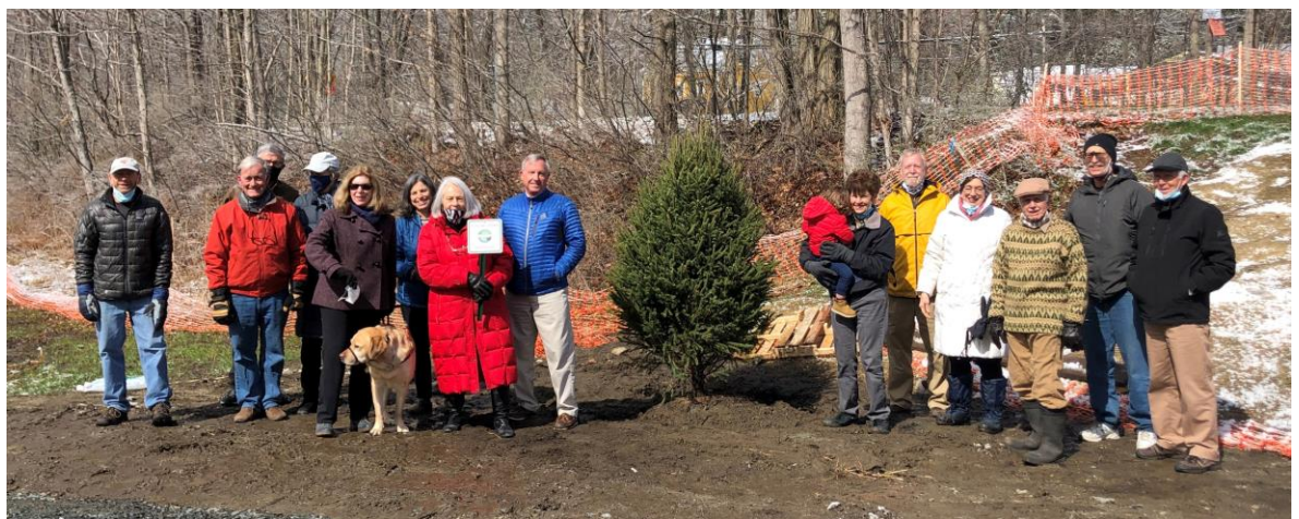
Mascoma Lakeside Park Committee, Interim Town Manager and Eastman Charitable Foundation Board Members