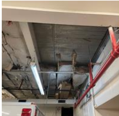
Poorly insulated and inefficient buildings Union Street Fire Station