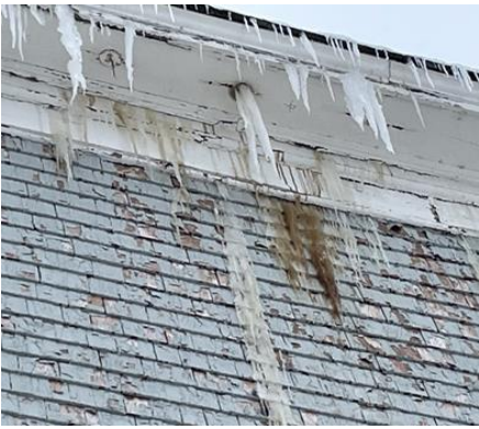
Water coming through walls