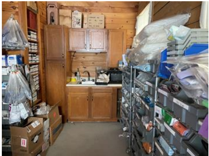
Inadequate space in EMS Building