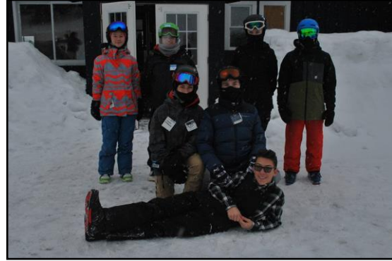
MVPR Ski & Ride 2019