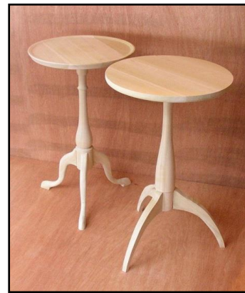
Candle Stands – March 2019 Class