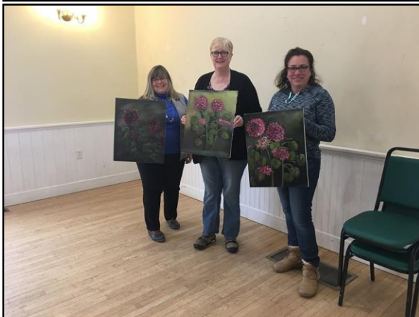
Bob Ross Style Painting Classes Northern Lights and Geraniums