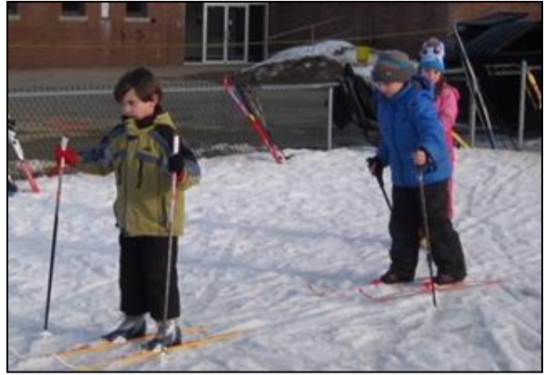
Youth Cross Country Ski Program - 2018