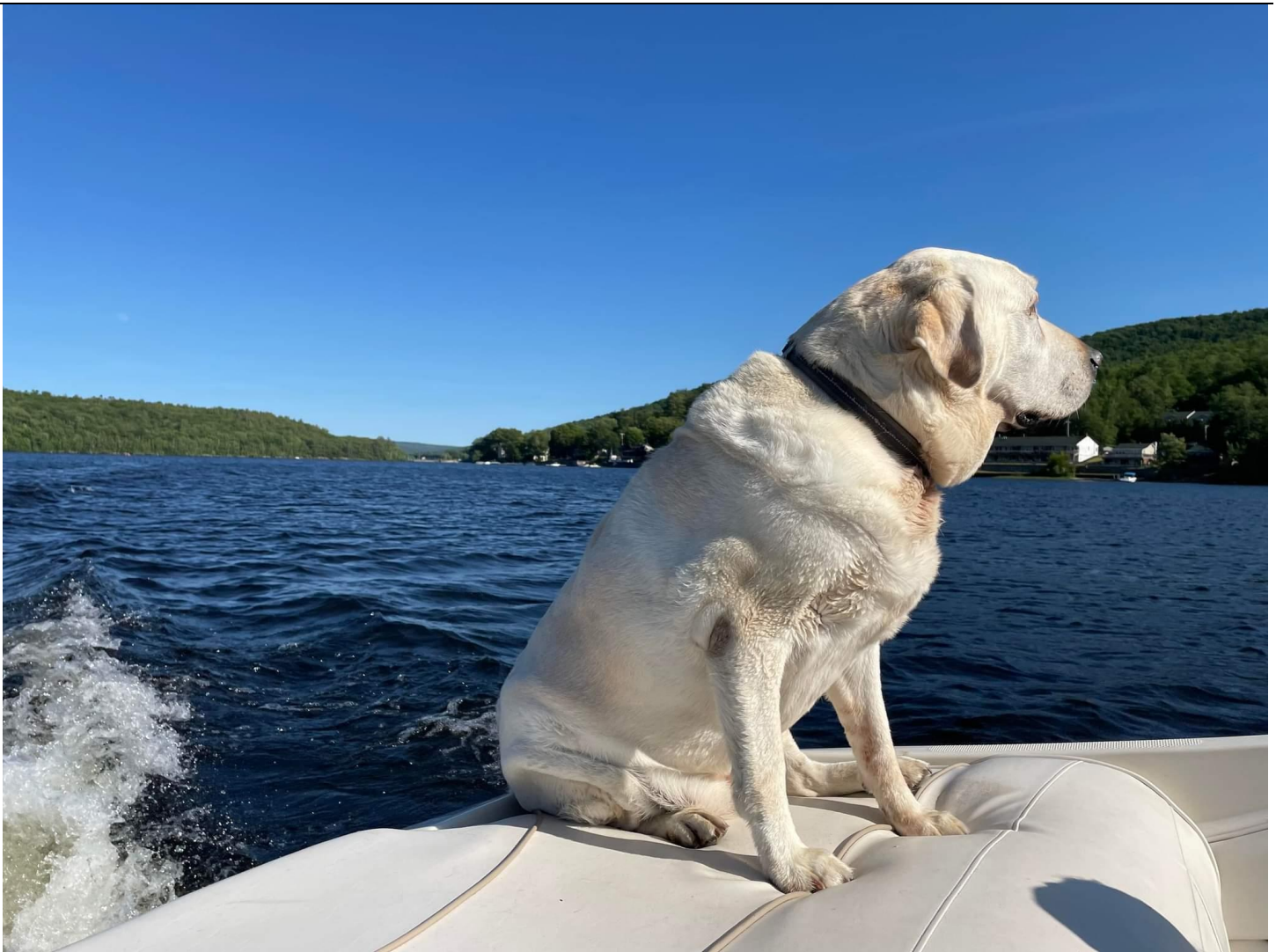
"Charlie dog on the boat"

Charlie, a beloved old yellow lab, loves touring Mascoma Lake on his boat. Just take it slow please!