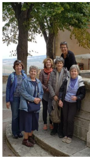
Il Circolo Italiano in Italy!

The first annual "Tiger Run" was a resounding success! On Sunday, October