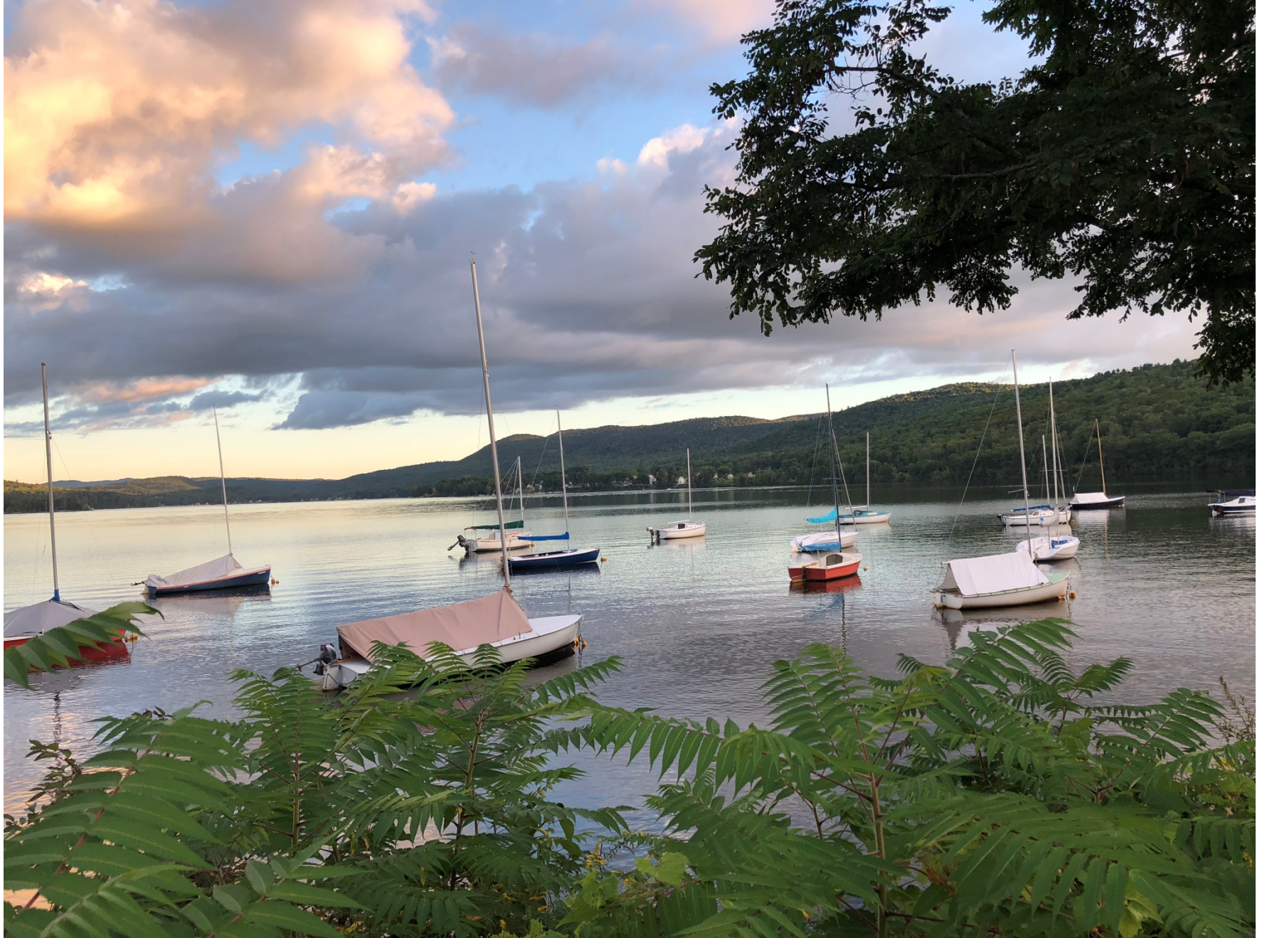
Mascoma Lakeside Park at Sundown